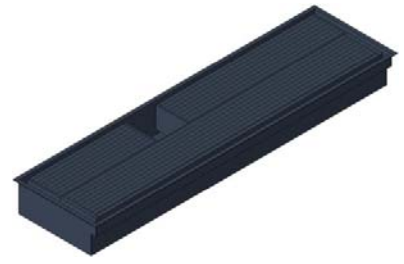
Family Type PL07 05 5/0