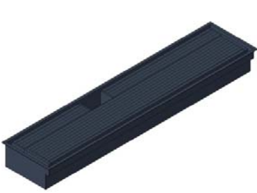
Family Type PL07 03 5/0