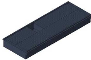
Family Type PL07 07 7/0